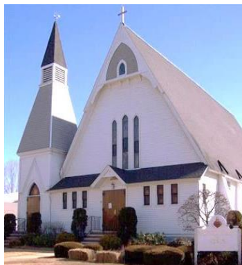
Sacred Heart of Jesus Church 22 West Main St. West Brookfield, MA 01585

Mass Cards for the living or deceased and for special occasions are available at the rectory. If you call ahead (leave a message if necessary) we will have it ready for you.