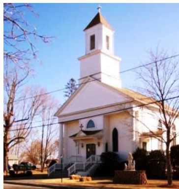
St. Mary Oratory 11 Lincoln St. Brookfield, MA 01506